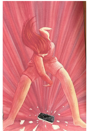
"Student work from the AP Art and Design Portfolio, 2025."

The AP exam schedule for 2025-2026 can be found here .